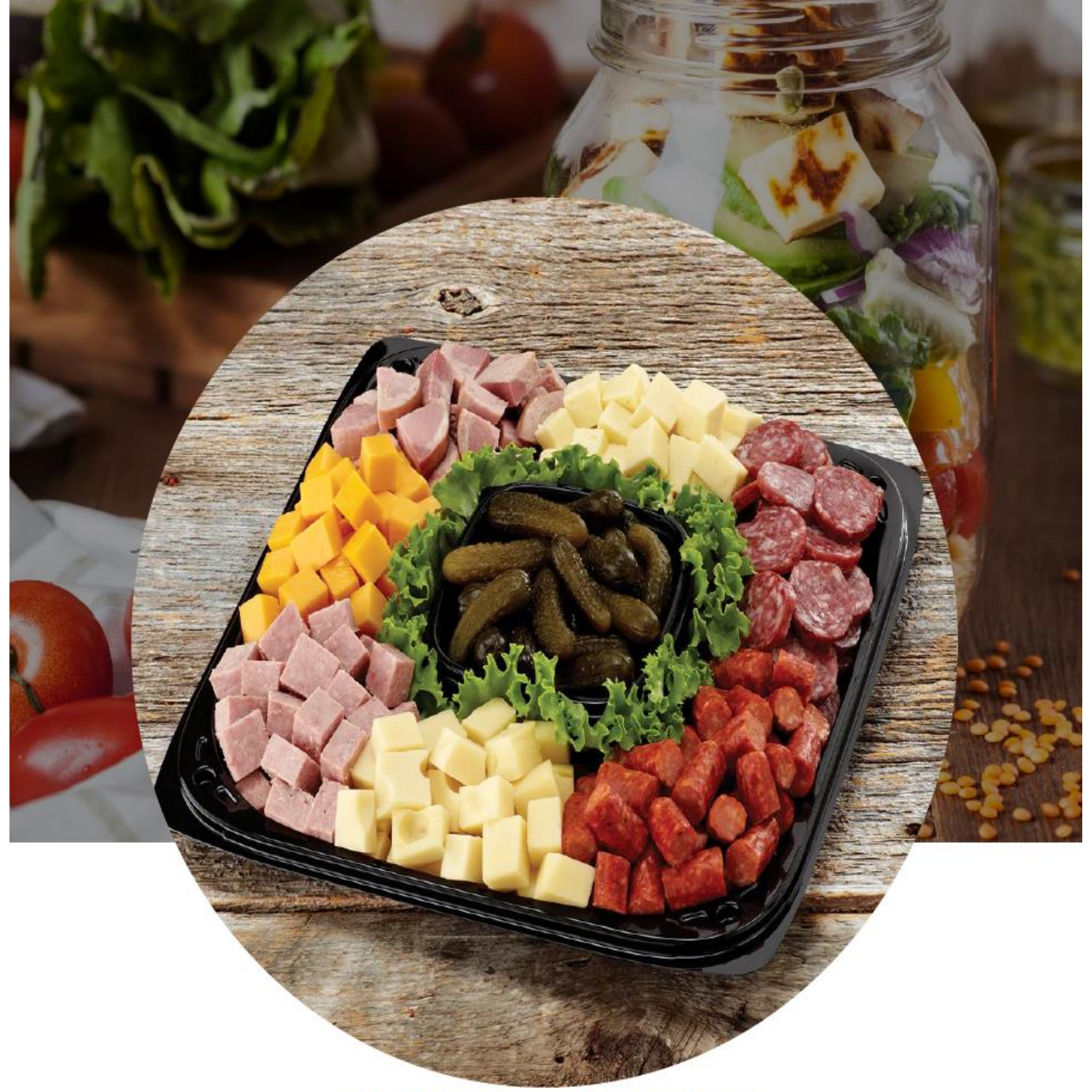
KKC WHINY CHEESE PARTY!

Saturday, May 18<sup>th</sup>, 2024, following BIS at ringside, in conjunction with the Junior Handling Zone Finals. Snacks and non-alcoholic beverages supplied!